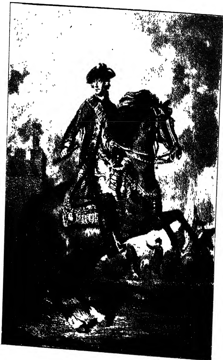
FIELD-MARSHAL EARL LIGONIER. FROM AN ETCHING BY S. W. REYNOLDS, AFTER THE PORTRAIT BY SIR JOSHUA REYNOLDS IN THE NATIONAL GALLERY.